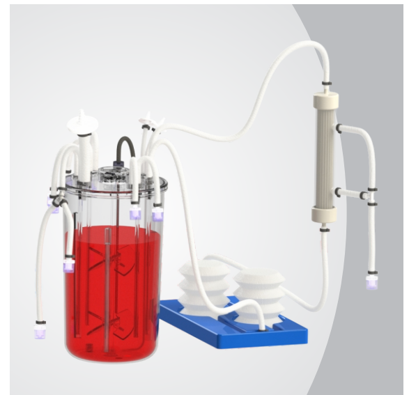
250 ml culture vessel with integrated perfusion set-up

The MiniBRx™ 0.25L multi-bioreactors are high throughput, Perfusion enabled automated bioreactor system for process development with up to 16 fully featured single-use 100ml/250ml mini-scale bioreactors. This system integrates Ready-to-plug & easy connect bioreactors with flexible and user friendly software that enables scientists to manage many more experiments at the same time while reducing the costs per experiment. MiniBRx™ 0.25L is an accurate and cost-effective system capable of replicating bioreactor conditions, and can be used as a microscale model for a wide range of upstream processes such as Perfusion clone selection, process characterization and process optimization studies.